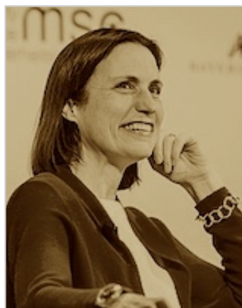
Fiona Hill (at MSC)