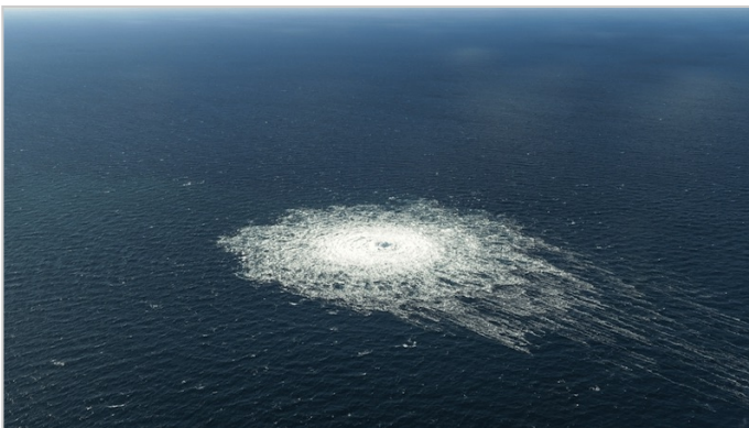
Nord Stream Pipeline Explosion Site

Apparently, a tiny area in or near the Polish city of Gdansk refuses to adhere to true Christian values, even to this day, it seems. A good thousand years later, on September 26, 2022, and not too far from Gdansk, the entire world was shocked to see a gigantic bubble erupt on the surface of the Baltic Sea as a result of a total of three explosions near the Nord Stream pipelines at the bottom of the sea.