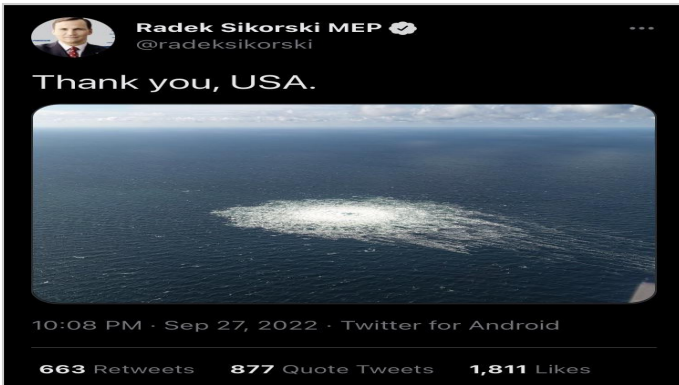
Twitter message "Thank you, USA" by Polish

Noteworthy is that German Chancellor Olaf Scholz visited Oslo, Norway a good month before the first explosion at the NordStream 2 pipeline was discovered. On August 15, 2022, he participated in the so-called 'Nordic Counsel', where he met a total of 5 Scandinavian heads of states within 8 hours, discussing energy issues and the Ukraine war. Whether it was discussed early on there in Oslo to have the now exploded former NordStream gas pipelines be replaced with a gigantic liquid natural gas LNG-Terminal outside of Rügen Island , intended to be harboured not too far from the previous endpoints of NordStream 1 and 2, is unknown so far.