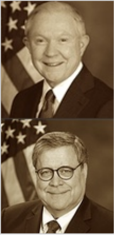
Sessions / Barr

leadership issues the superseding indictment against Assange.