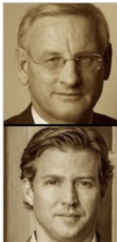
Bildt / Ross