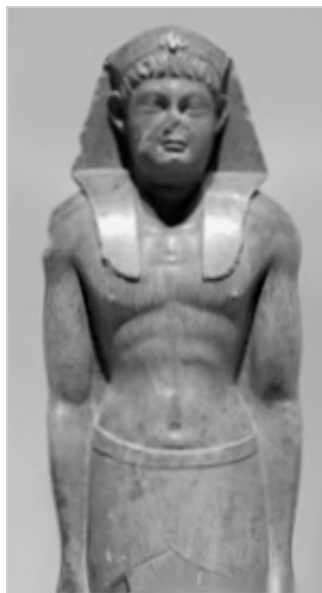
Young Egyptian ruler with Greek/Roman character, potentially Caesarion

Historically verifiable happenings from ancient Egypt reveal that quite a few biblical stories correlate significantly with hieroglyph scripted incidents of pharaoh's and their heirs. One of them is particularly interesting. Roman emperor Julius Cesar met Egypt's famous Cleopatra in 48 BC, they had an affair and Cleopatra gave birth to a son named Caesarion from that relationship. Four years later, Caesar was murdered in Rome. Cleopatra waited in Rome for little Caesarion to be made his father's heir, only to find out that Caesar's grand-nephew Octavius was chosen as Rome's new emperor, probably with decisive Roman-political support. The emperor's succession line was a serious and potentially deadly thing back then, so Cleopatra returned to safe haven Alexandria with Caesarion, where Cleopatra would begin an affair with another powerful Roman: Marc Antony.