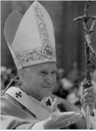
Pope John II.

but also against the Greeks themselves now. Similar to the Greeks, the majority of Romans believed in an entire set of many Gods in the empire's beginning, attributing even each of the sky's planets to a God. Romans also had many high-priests instead of just one intermediary. Egypt's ancient and strict view of a pyramidal single God-mediator ruler at the top was clearly under attack on two fronts, lead by the Greeks and the Romans now.