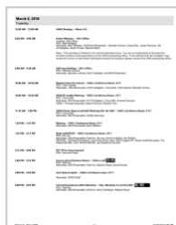
FOIA Calendar DAG Rosenstein 2018