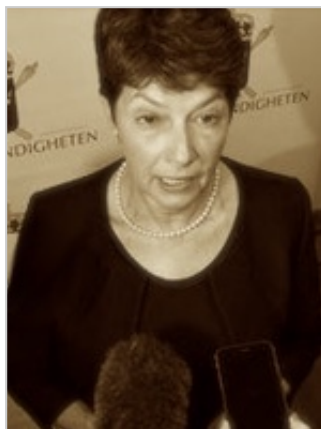
Gothenburg's Prosecutor Marianne Ny